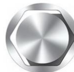
Hexagonal with embossed washer