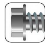
Hexagonal with embossed washer